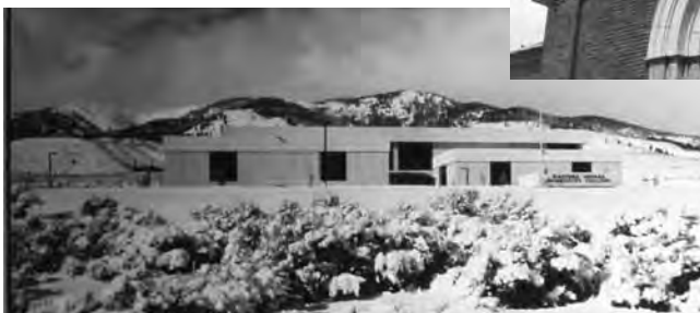
ABOVE: First home of WNCC-Carson City Civic Auditorium.