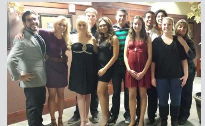
Douglas Diversity Club

Spring Class Schedule: Register Now Mitten Tree Donations Warm Area Families Angel Tree: Spread Joy to a Child in Need Fundraising Events Help Others